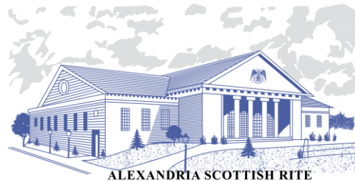
ALEXANDRIA SCOTTISH RITE