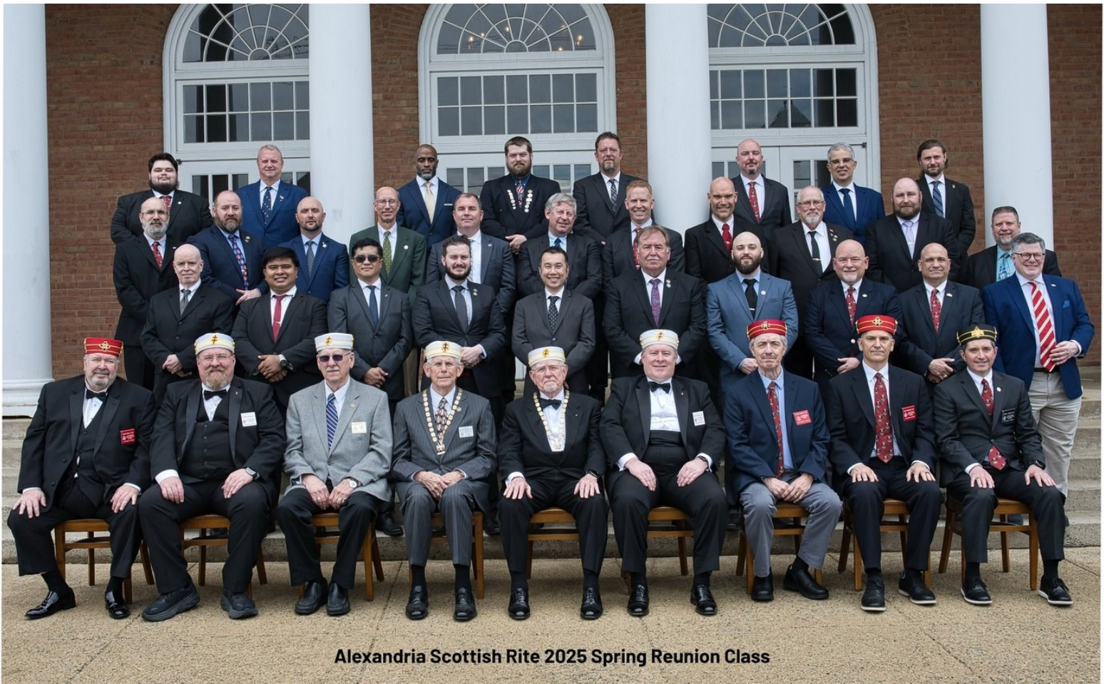
Alexandria Scottish Rite 2025 Spring Reunion Class