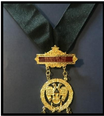
Basic Medallion with Black Ribbon 500 POINTS