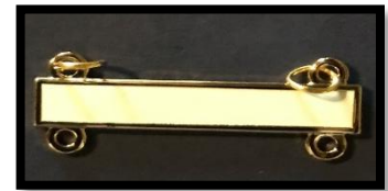
White Hanging Bar 1,500 POINTS