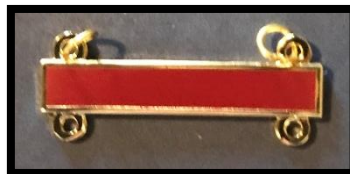
Red Hanging Bar 1,000 POINTS