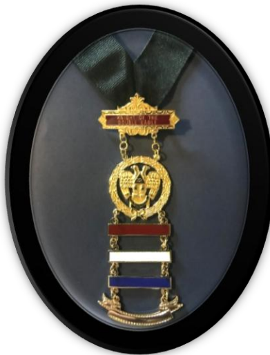
Gold Hanging Bar 2,500 POINTS